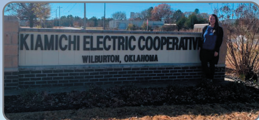
We love Cooperative visits. This past quarter Energize staff members were welcomed by Canadian Valley, Kiamichi, and Central Rural Electric Cooperative. Thanks for letting us visit your Coop!