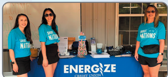
Energize Credit Union loves any chance we get to be out & about serving members and the community. This past quarter we were spotted at Shoot for the Nations and the OSU career fair!